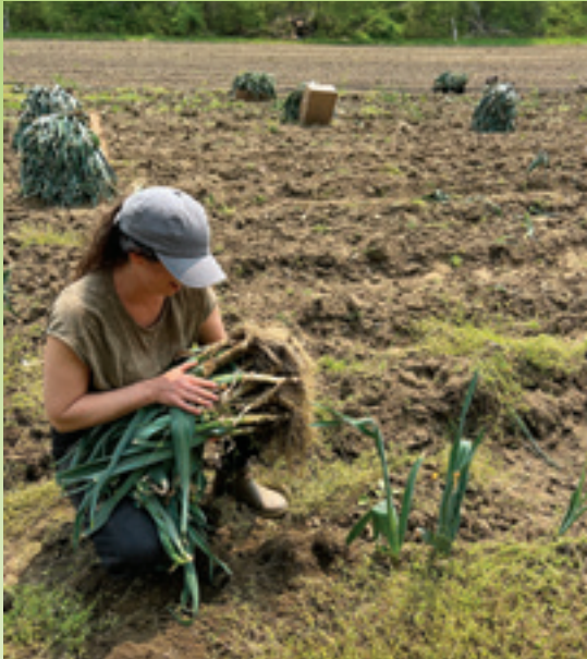
Salvation Farms helps create more equitable access to local nutrition.