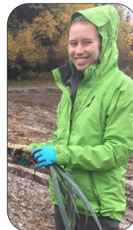
Volunteers glean happily - rain or shine.

Farmers surveyed said they had 100% confidence and 100% ease when working with our program staff. When sites were asked about the impact that receiving gleaned produce has on their site and the clients they serve, 81% stated they agree or strongly agree that their site has greater interest in and comfort using fresh food.