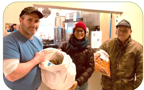
Capstone's Head Start Program in Morrisville receives a delivery of gleaned root crops.