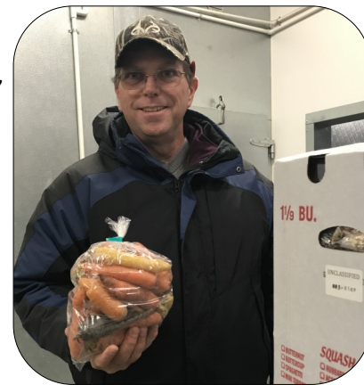
Trainees gain valuable skills in food handling and manufacturing.

The 16-week job training component of our food hub offers second chances to individuals who have experienced homelessness, incarceration, addiction - or who simply face some barrier to employment - like being a single parent or living with a disability.