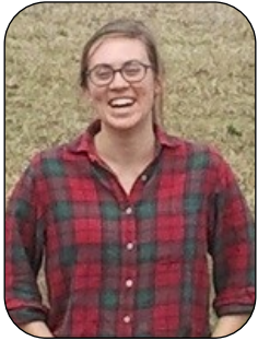
First day of service (2013)

Salvation Farms P.O. Box 1174 49 Portland Street Morrisville, VT 05661 info@salvationfarms.org 802-888-4360